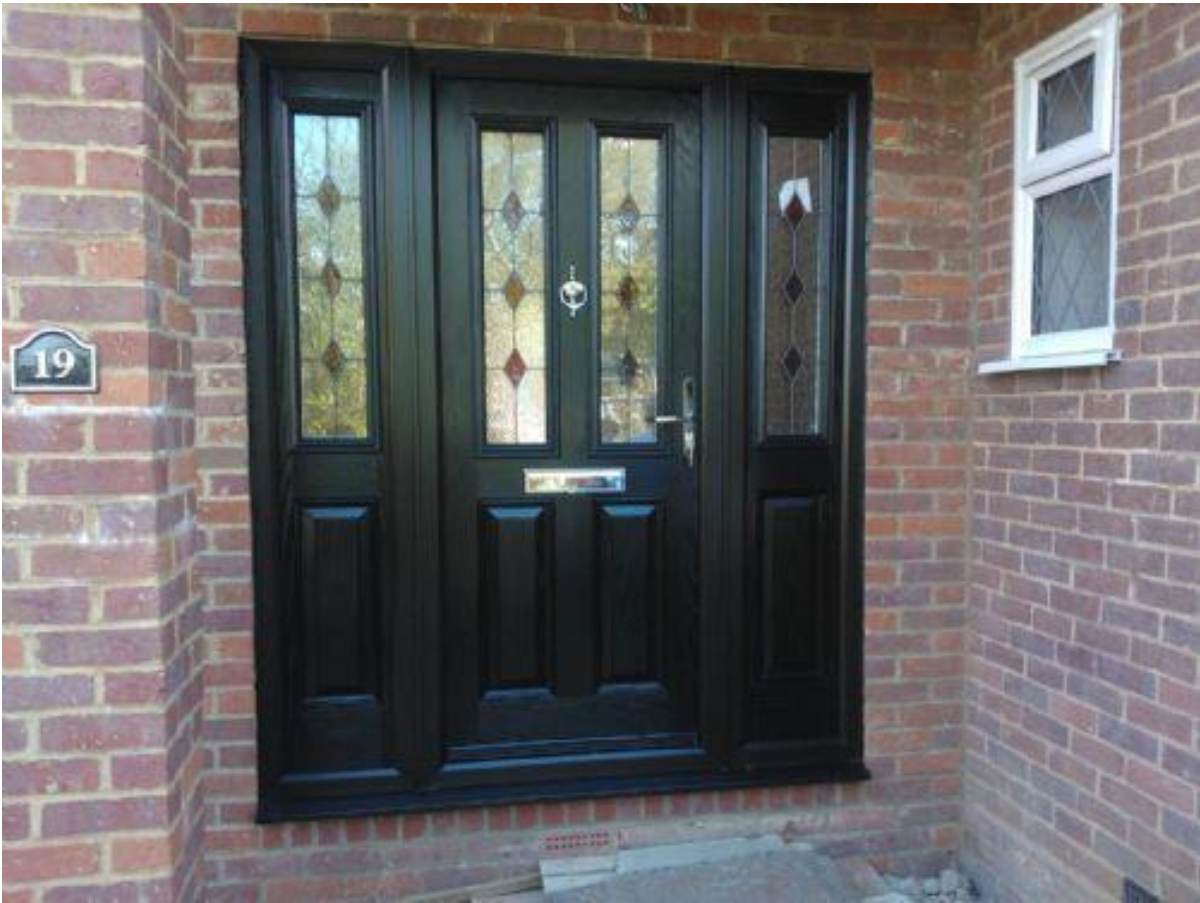
External main entrance door

External bi-folding doors – (garage and main front elevation) Details from (Eurocell) brochure copy submitted for illustration purposes only - colour Ral 7032 (Pebble Grey) to match windows.