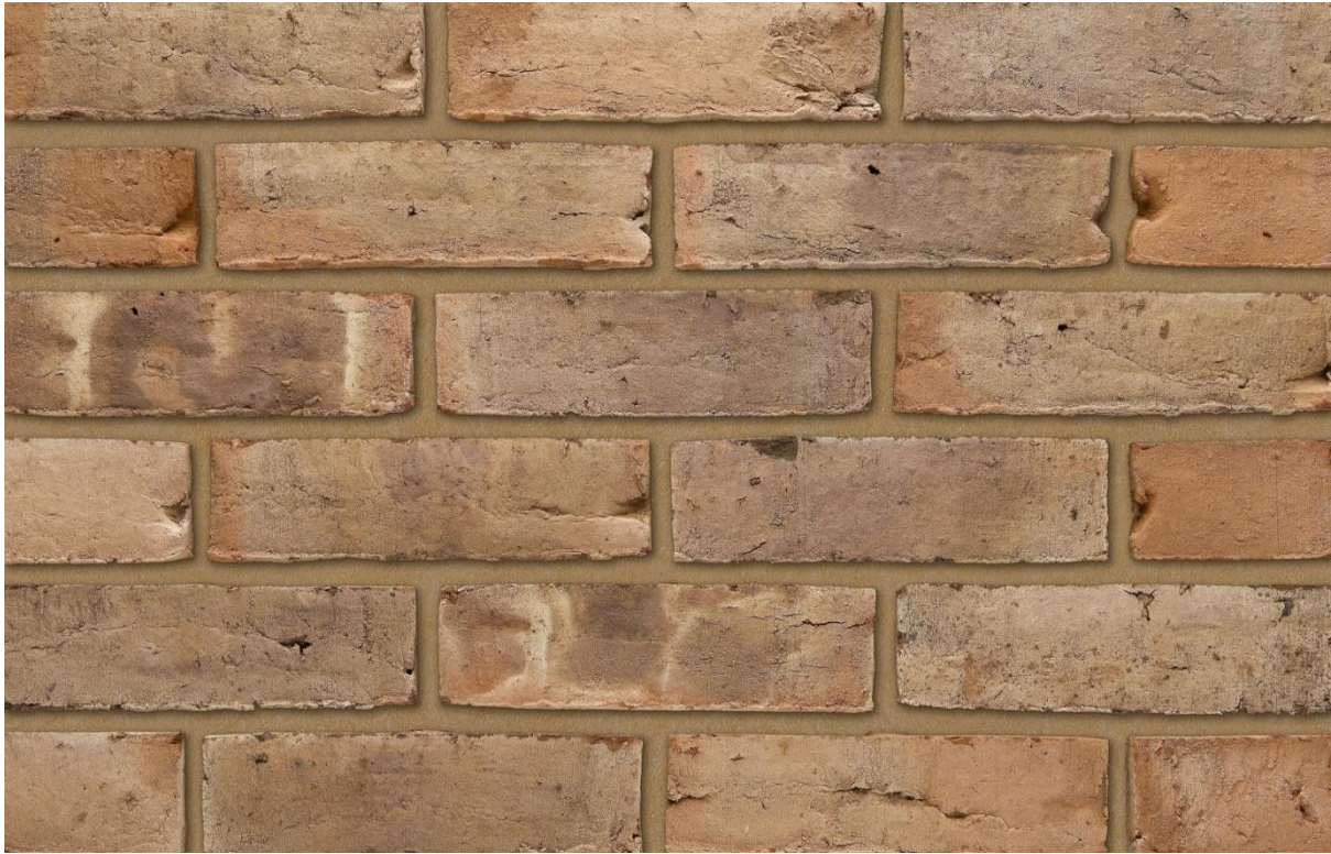
External facing brick - Ibstock Olde English Birtley Buff (brick code A2605A) with matching mortar http://www.ibstock.com/