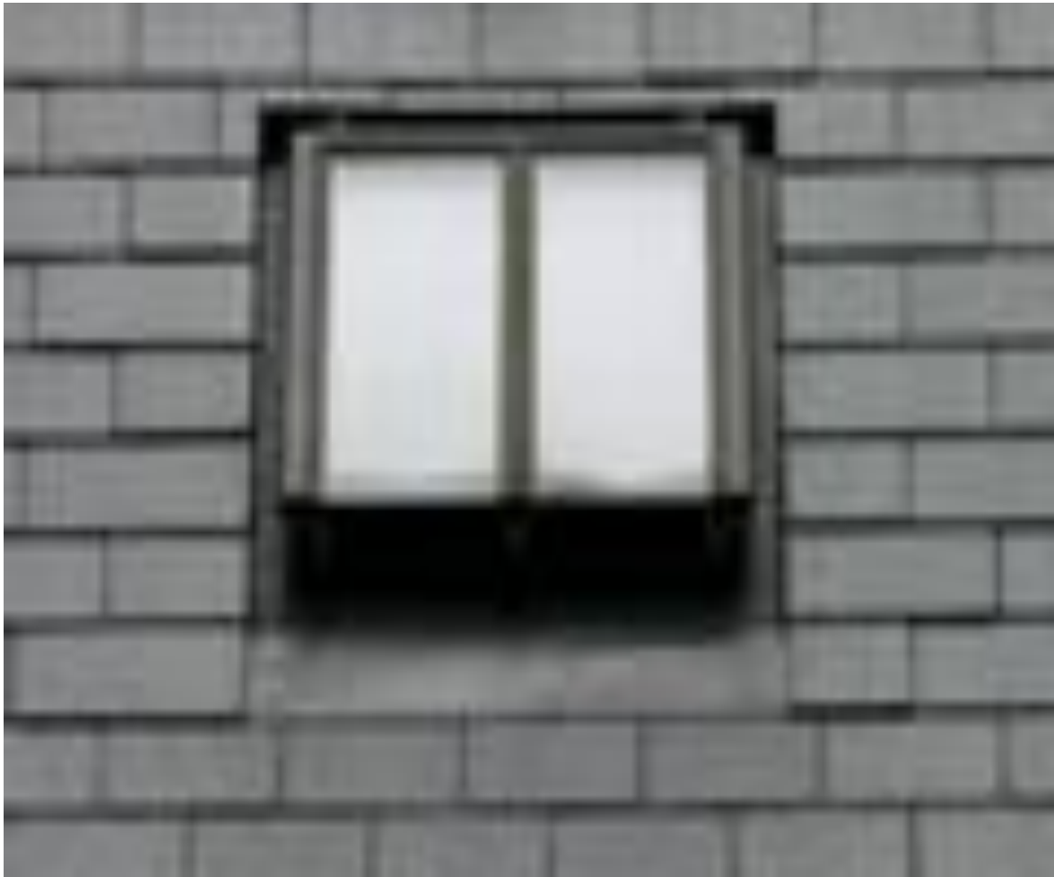
Conservation rooflight detail