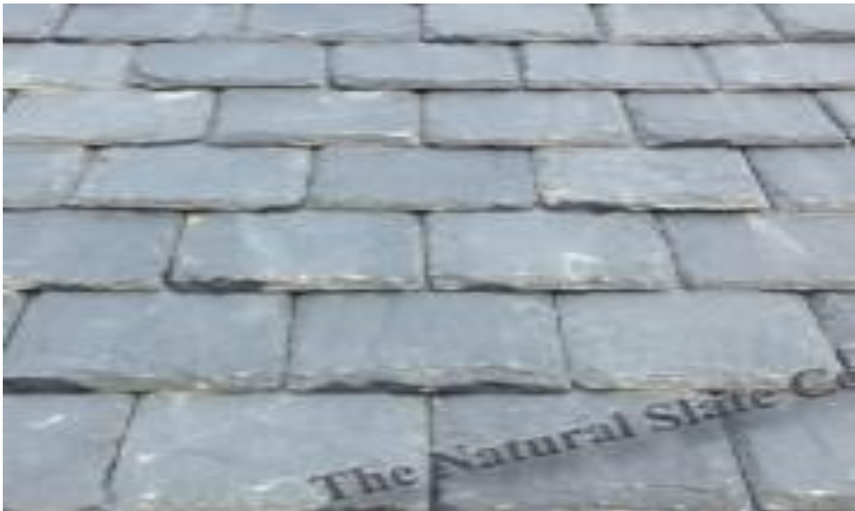
Roof tile – Fesco Caledonian heavy slate http://www.theslatecompany.co.uk/shop/fesco-caledonian-roofing-slate/